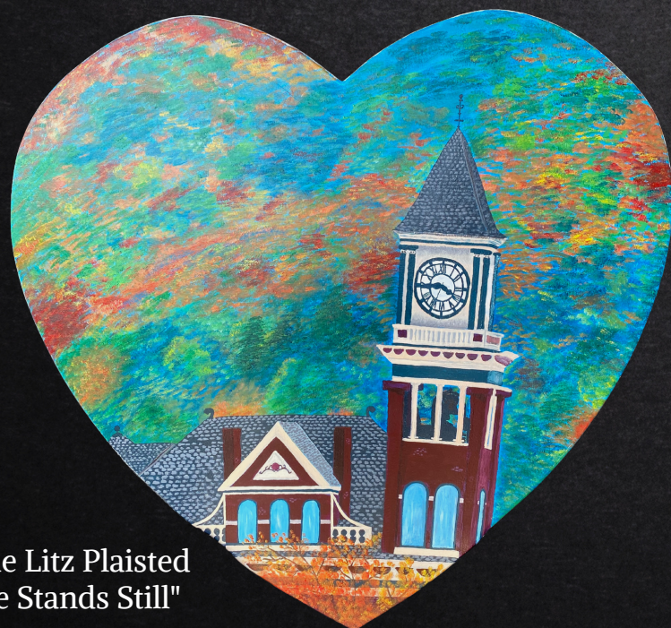
Brielle Litz Plaisted "Time Stands Still"