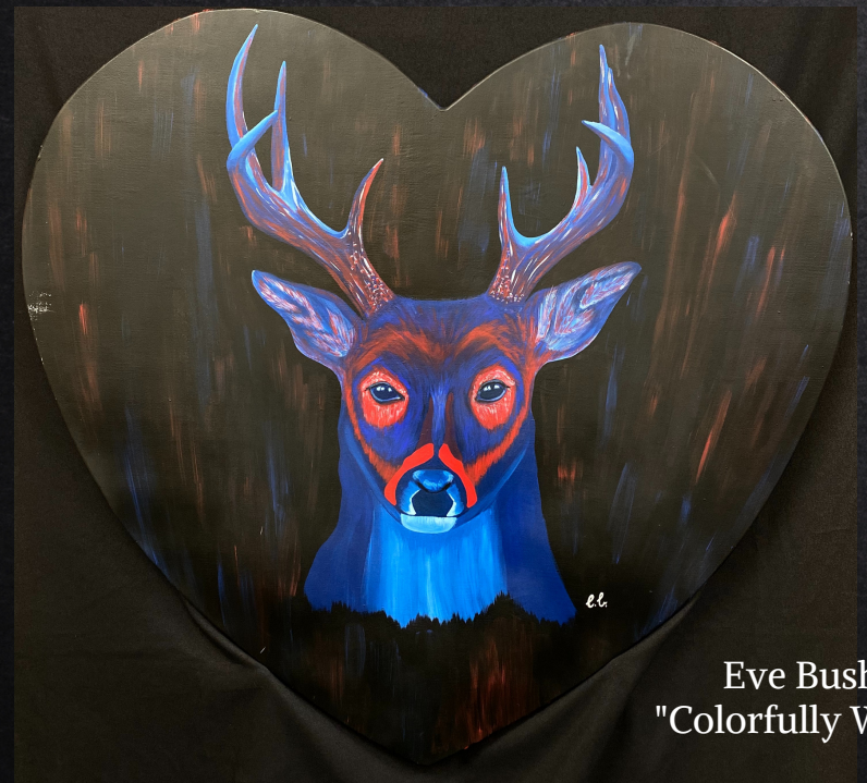
Eve Bush "Colorfully Wild"