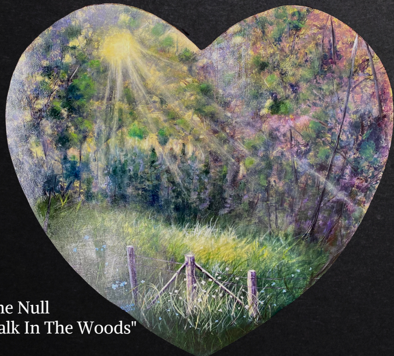
Diane Null "A Walk In The Woods"