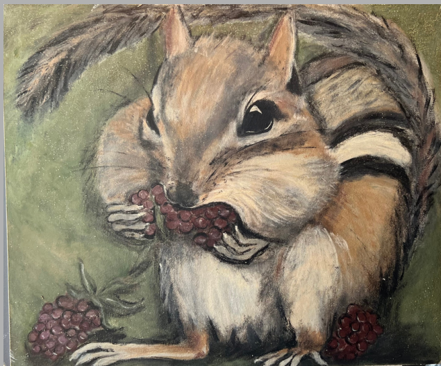
Pamela Pedersen - "Chip - Chip - Hooray"