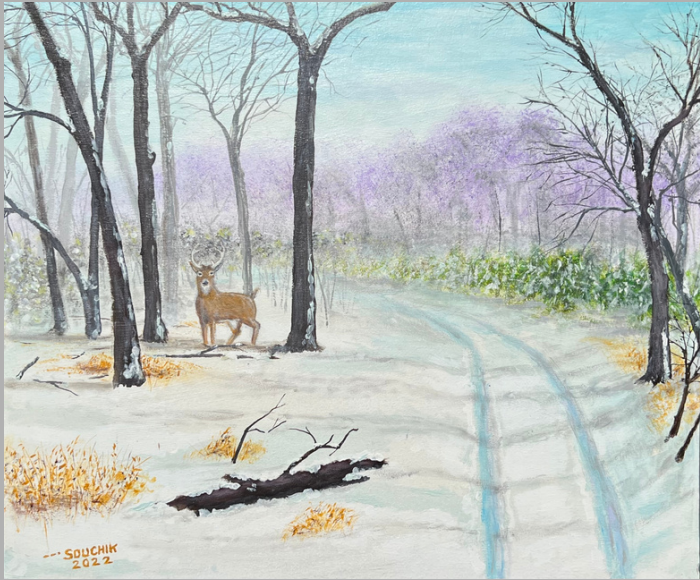
Greg Souchik - "Winter Forest Road"