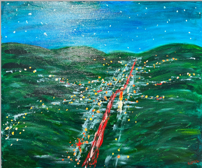
Rick Minard - "Northward View"