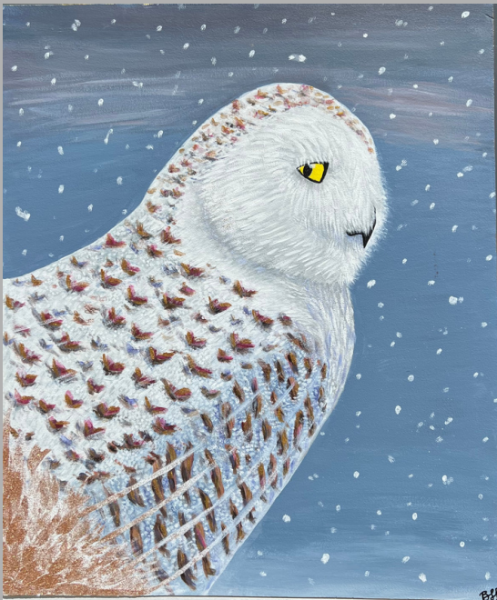
Brielle Litz Plaisted - "Hope is Found"