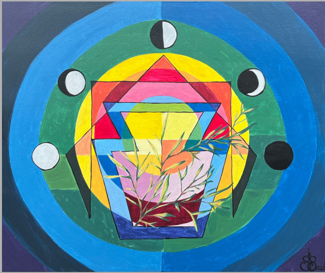
Shelley Steffey - "Hold Sacred Spaces"