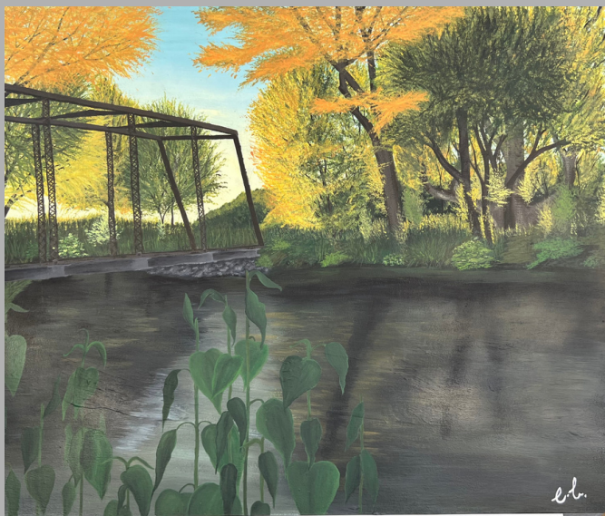
Eve Bush - "Water Under The Bridge"