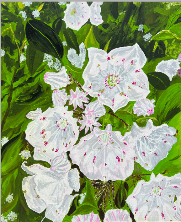
Allison Ambrose – "Commonwealth of Beauty"