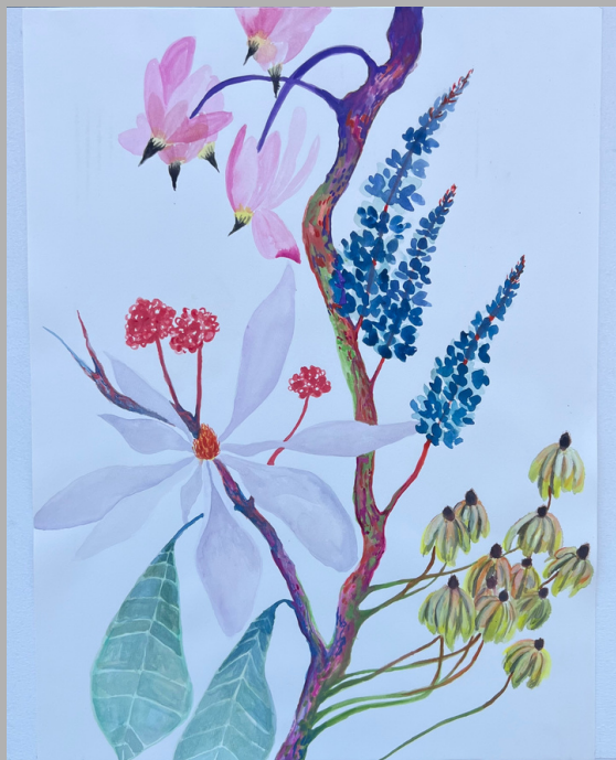
Kacy Huston - "Nexum"